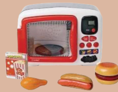
Toy Microwave/ Kitchen