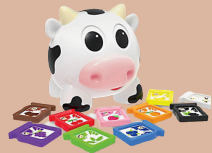
Piggy Bank/ Color Counting

Tip: Get toys that don't make sounds so that the child can vocalize more!