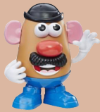
Mr. Potato Head